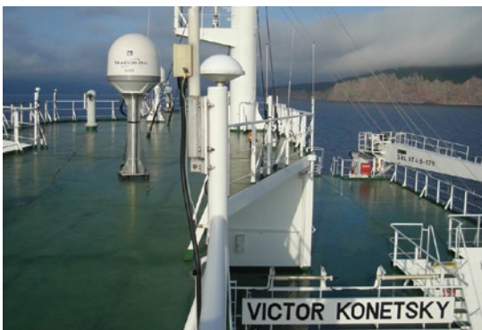
KVH's TracVision M9 provides satellite TV entertainment for crew members aboard many Unicom vessels, including the crude oil tanker Victor Konetsky.