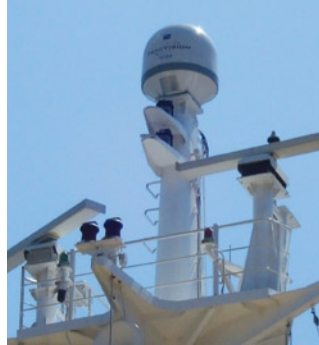
Unicom's TracVision M9 systems were installed by the vessels' electrical engineers, with activation completed in less than two hours for each antenna.