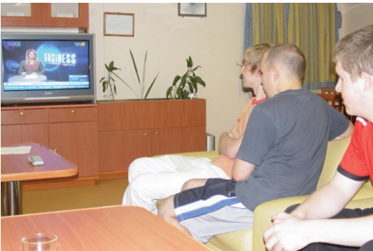
Crew members aboard Unicom vessels can now enjoy satellite TV during their downtime thanks to the TracVision M9 from KVH.

Crew members aboard Unicom vessels now have a way to keep up with what's going on in the world, as well as a creature comfort that is invaluable during long trips out to sea.