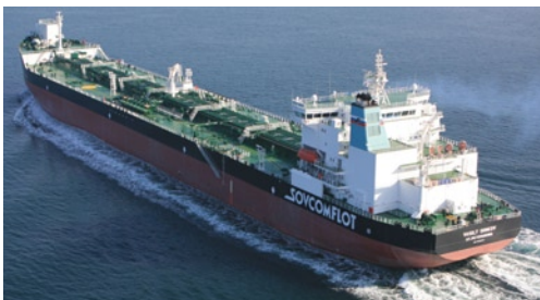
Unicom installed TracVision M9 satellite television systems on a variety of vessels, including the Arctic shuttle tanker Vasily Dinkov.

Unicom, a division of Sovcomflot, Russia's largest shipping fleet, installed KVH's TracVision M9 satellite TV system on its fleet in an effort to improve crew morale. In an industry where crew members are often at sea for months at a time, bringing something like satellite TV onboard can provide a much-needed sense of home, keeping the crew focused and motivated. The TracVision M9 systems achieved just that, according to Unicom officials.